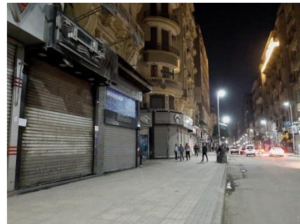
(Illustration is of an empty street in Cairo.)

Covid-19 Instigates Western-Guided Global Wide Utopian Movement